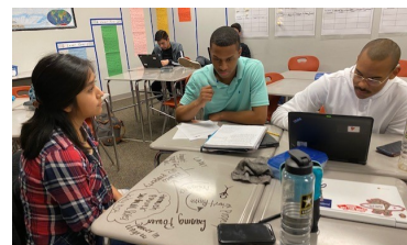
Student team using technology and dry-erase desk tops while brainstorming ideas.