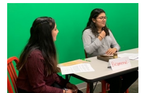
Student team using green screen to record persuasive speech.